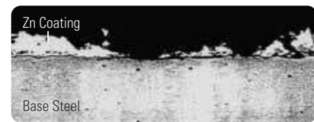
Figure A - Microscopic view of galvanized steel

Sacrificial protection is provided by an active metal (e.g. zinc), protecting a less active metal (e.g. steel). The more active metal corrodes in preference to the less active metal (figure A). ZINCALUME® steel exhibits a more complex coating structure consisting of both zinc-rich and aluminium-rich areas (figure B). The zinc-rich area provides excellent sacrificial protection, while the aluminium-rich area provides durable barrier protection. It is the combination of these two characteristics that make ZINCALUME® steel durable and effective against corrosion.