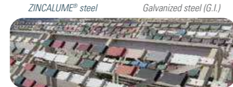
Bellambi Point site, Australia

Corrosion rates of galvanized steel and 55% Al-Zn alloy coated steel at Australian Atmosphere Exposure Test Sites.