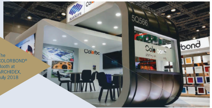
The COLORBOND® Booth at ARCHIDEX, July 2018