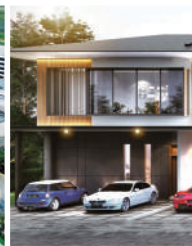
The Japanese-inspired Aeres Collection in Eco Ardence, Setia Alam – its unconventional roof uses COLORBOND®