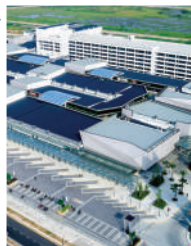
Design Village Outlet Mall is one of Penang's most popular shopping destinations – roofed by COLORBOND®

Every BlueScope product excels in its own class, and COLORBOND® is no exception. That is why, these buildings are special, as they are the epitome of COLORBOND®'s exceptional qualities. Strong and beautiful, these buildings will serve people for many years to come.