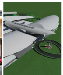
KL Air Traffic Control Centre – modelled after the 'wau', celebrated in Designing For History, an initiative by BlueScope Malaysia to share the stories behind great architecture