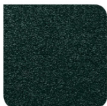
DAZZLING BLACK for stylish sophistication (SRI 20)