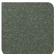
THUNDER GREY for a brilliant shimmer (SRI 36)

VERMOE™ steel is available in four elegant colours: