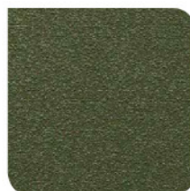
NATURE GREEN for simplistic classiness (SRI 25)