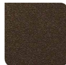
ALLURING BROWN for a polished elegance (SRI 23)