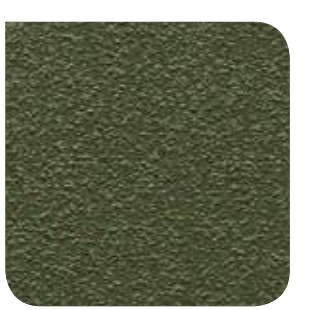
Nature Green (SRI: 25)