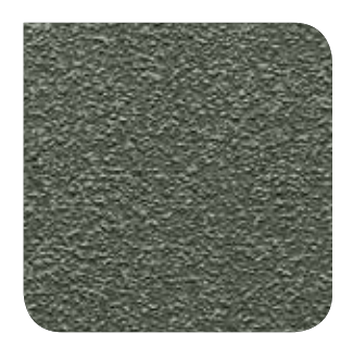
Thunder Grey (SRI: 36)

VERMOE™ steel means versatile and modern. With its colour, finish and the freedom to design flat roofing or soaring shapes, VERMOE™ steel provides the opportunity for you to create. Available in various contemporary colours and size options to realize your design vision, VERMOE™ steel is a great addition to the allure of a modern home.