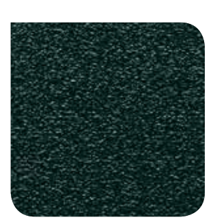
Dazzling Black (SRI: 20)