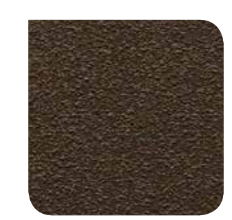
Alluring Brown (SRI: 23)

Solar Reflectance Index (SRI) is calculated using ASTM E1980 and Medium Convection Coefficient (12) value reported. This data is approximate values only, may vary based on paint formulation and/or metallic coating thickness.