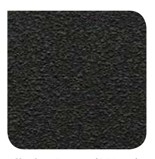
Alluring Brown (SRI: 23)

Solar Reflectance Index (SRI) is calculated using ASTM E1980 and Medium Convection Coefficient (12) value reported. This data is approximate values only, may vary based on paint formulation and/or metallic coating thickness.