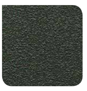
Nature Green (SRI: 25)