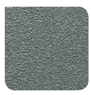
Thunder Grey (SRI: 36)

VERMOE® steel means versatile and modern. With its colour, finish and the freedom to design flat roofing or soaring shapes, VERMOE® steel provides the opportunity for you to create. Available in various contemporary colours and size options to realize your design vision, VERMOE® steel is a great addition to the allure of a modern home.