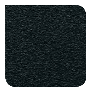
Dazzling Black (SRI: 20)