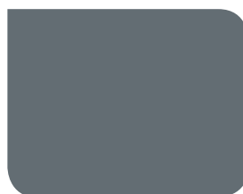
Graphite Matt (SRI:26)