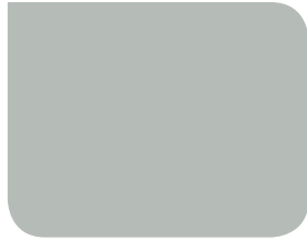
Winter Matt / *Sonata Matt (SRI:80)

Contemporary in appearance yet durable and strong, the matt variant beautifully diffuses light for an elegant design appearance.