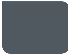
Graphite Matt / *Iron Matt (SRI:26)