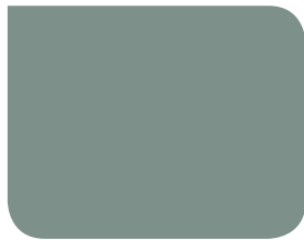
Hidden Matt / *Alley Matt (SRI:47)