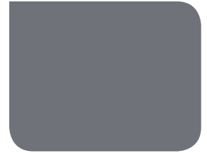
Pebble Grey (SRI:40)