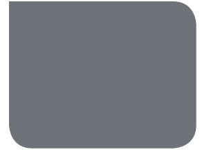
Pebble Grey (SRI:40)