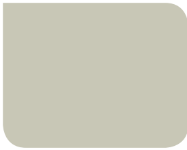
Kapar Sandstone (SRI:66)