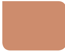
Copper Penny (SRI:54)