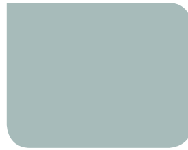
Aegean Green (SRI:59)