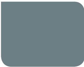
Majestic Grey (SRI:39)