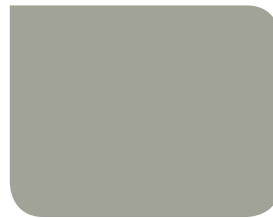
Platinum Grey (SRI:53)