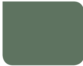
Palm Green (SRI:36)