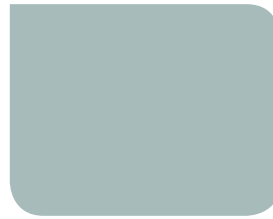
Aegean Green (SRI:59)