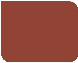
Yulara Red (SRI:36)

Elevate the prestige of any architectural icon with premium colour durability and excellent weatherability. This ultimate variant comes with a custom-formulated paint system that delivers magnificence.