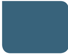
Straits Blue (SRI:28)