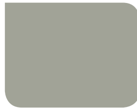
Platinum Grey (SRI:53)