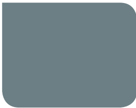
Majestic Grey (SRI:39)