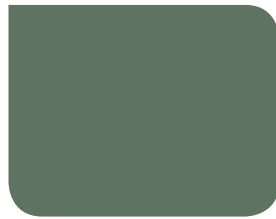
Palm Green (SRI:36)