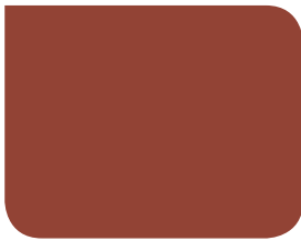
Yulara Red (SRI:36)

Elevate the prestige of any architectural icon with premium colour durability and excellent weatherability. This ultimate variant comes with a custom-formulated paint system that delivers magnificence.