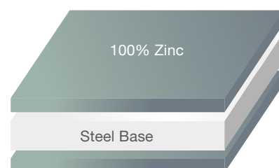
Other brand (GI)